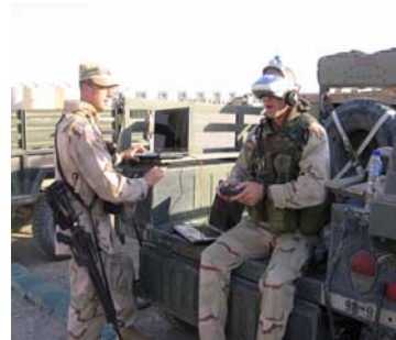
Figures 19, 20. User Tests – Iraq Combat Stress Control Team.