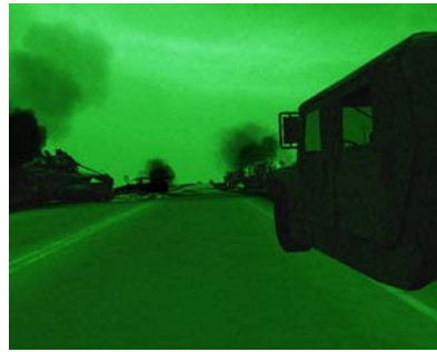
Figures 13, 14. Helicopter View ~ Night Vision View.