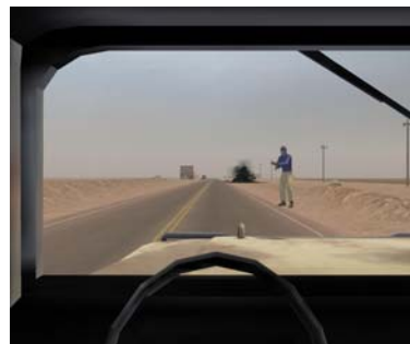
Figures 7, 8. Desert Roads.