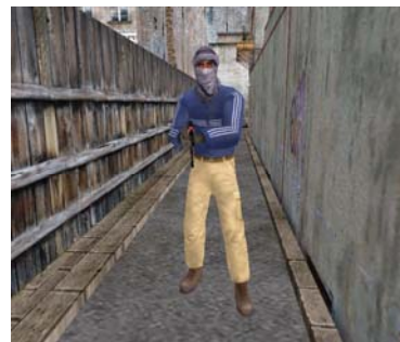
Figures 15, 16. Clinical Interface ~ Insurgent “Attack”.