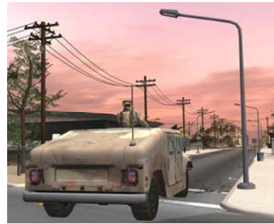
Figures 3, 4. Large City Scenarios.