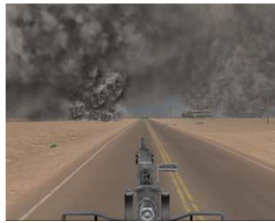
Figures 11, 12. “Flocking” Patrol ~ Turret View.