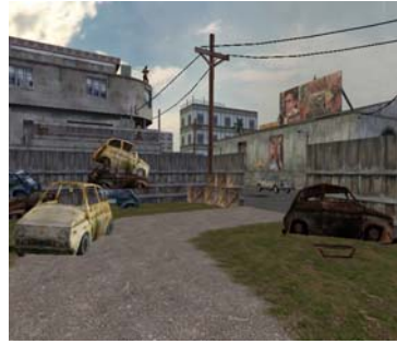
Figures 1, 2. Small City Scenarios.