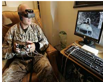
Figures 17, 18. Insurgent “Attack” ~ USA User Tests.