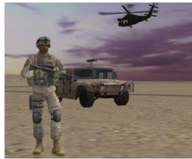
Figures 5, 6. Desert Outskirts.